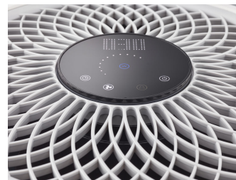
UVCA200 UV-C Floor standing air unit